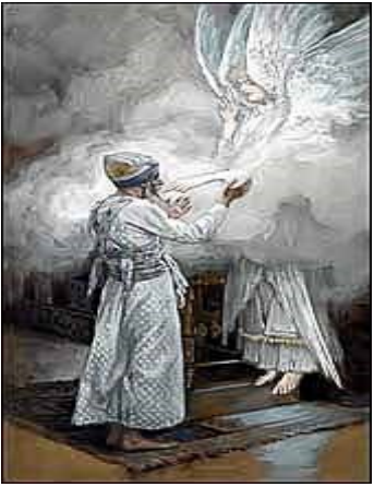
Zechariah burned incense in the temple when an angel appeared to him (Luke 1:9-10). James J. Tissot, 'The Vision of Zecharias' (1886-94), gouache on gray wove paper, Brooklyn Museum, New York.

The angel is comparing Cornelius's prayers and righteous deeds to the temple offering of fine flour and oil that is burned with frankincense on the altar producing a sweet-smelling "pleasant aroma" to the Lord (Leviticus 2:2, 9, 16; 5:12). Incense! David says something similar: